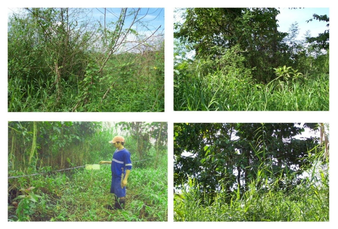
Figure 5. Peat Swamp Forest (Sampling site 3).

Sampling site 3 (10-14 masl), the Peat Swamp Forest (Figure 5), is situated at Sitio Panlabuhan, Poblacion Loreto, Agusan del Sur (Figure 2) at 08<sup>°</sup> 14.276' North latituide and 125<sup>°</sup> 52.664' Sampling was done for 12 days on September 21 to September 27, 2005 and November 22 to November 27, 2005. The site comprised a disturbed secondary forest area since it is near human settlements and an undisturbed primary forest area.