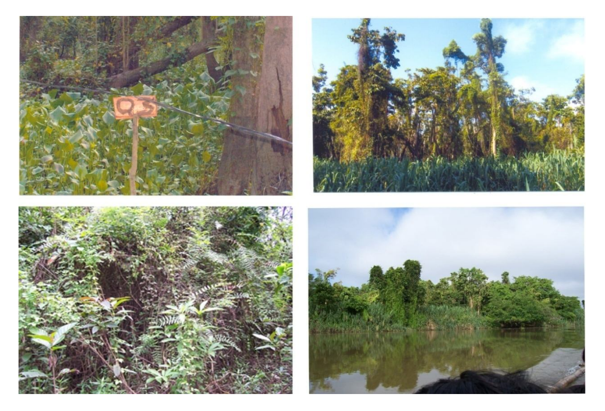
Figure 6. Mixed-swamp Forest (Sampling site 4).

Sampling site 4, the Mixed Swamp Forest, is situated in Sitio Panlabuhan, Poblacion Loreto, Agusan del Sur (Figure 6) at 08º 15.046' North latitude and 125º 52.381' East longitude at an elevation of about 12-16 masl. Sampling was done for 12 days on September 21 to September 27 and November 22 to November 27, 2005. Sampling site 4 has a flat slope. It is a disturbed secondary forest. The Mixed Swamp Forest is largely composed of Barringtonia racemosa (L.) Spreng and Nauclea orientalis regular. The height of emergent trees ranged from 12 to 20 meters and canopy ranged from 2 to 5 meters while highest DBH is 60 cm. Its emergent trees are of Family Rubiaceae and its canopy was dominated by Family Myrtaceae. Canopy vines, understory plants like ferns, water hyacinth Eichhornia crassipes (Mart.) Solms under Pontederiaceae, water lily, Pistia stratiotes L. under Araceae family and canopy epiphytes were observed. On site disturbances were observed such as farming corn, and kaingin on the edges near the bank of the river and Subaon Creek. Anthropogenic clearing was about 20 to 30 meters away from the sampling site. There were no exposed rocks; fallen logs were about 20%; the area has clay loam or loose soil type; humus cover was about 7 feet and leaf litter cover was 4 centimeters; mosses were abundant on body of trees or tree trunks about 70%; ficus (Ficus balete) Merr. was 80% abundant.