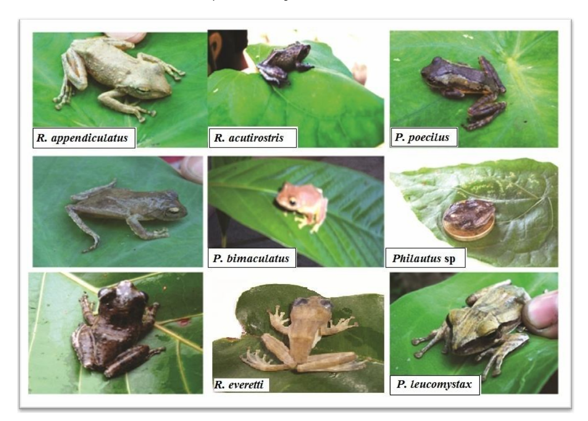
Figure 7. Frog species belonging to Family Rhacophoridae.

They reproduce in trees and low lying vegetation in the marsh. Their eggs are laid in foam above a water source so the tadpoles fall into the water once they hatch (Zweifel 1998). This suitable condition is provided by the marsh.