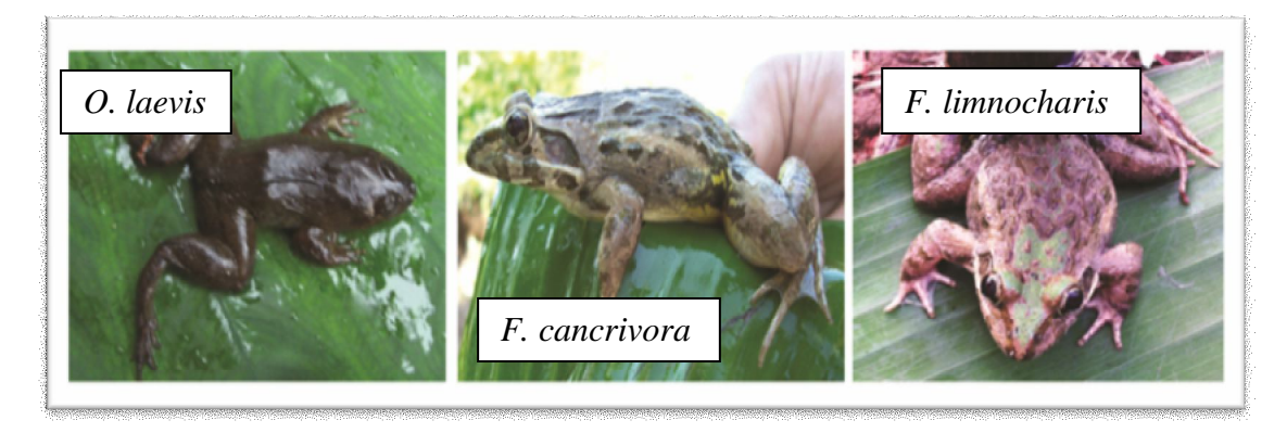
Figure 8. The three species of edible anurans eaten by Manobos, the indigenous people in the area.

Socio-economically important amphibians in the marsh . The three edible species of amphibians shown in Figure 8 are socio-economically important species in Agusan marsh for food and bait. F. cancrivora was introduced in the marsh by migrants while O. laevis and F. limnocharis are native in the area. The presence of exotic species is a threat to native ones but useful to humans since aside from being used as food and bait, it plays an important role in decreasing mosquito population. An absence of frogs in an ecosystem may boost the presence of agricultural pests and mosquitoes (Abdulali 1985; Oza 1990) given their important role as predators. Furthermore, tadpoles are able to consume bacteria and algae, thereby acting as antagonists to the eutrophication of water bodies (Mohneke 2011).