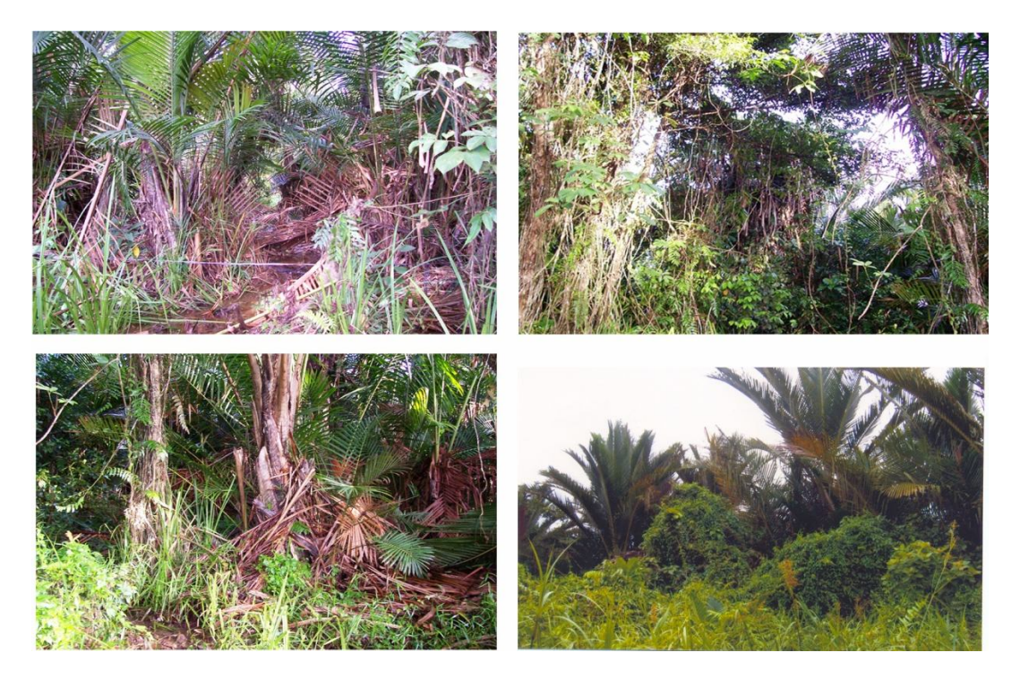
Figure 3. Sago Forest (Sampling site 1).

The Sago swamp forest is a secondary forest dominated by Metroxylon sagu or "sago" under the Palm family or Arecaceae. There were other trees spotted in the area like Ficus nota (Blanco) Merr. under Family Moraceae. Height of the emergent trees ranged from 5 to 23 meters and the height of canopy ranged from 1 to 9 meters while highest diameter at breast height (DBH) of emergent trees is 45 centimeters. The canopy vines were Mikania cordata (Burm. f.) B. L. Rob and Stenochlaena palustris (Burm. f.) Bedd, which is about 60% and canopy epiphytes of Family Poaceae. Some of the known understory and ground cover plants were Paspalum conjugatum P. J. Bergius of Family Poaceae. The Indian rubber tree ( Ficus elastica ) is also present. Pitcher plant was found; moss density was about 40%; leaf litter is 90% and the depth of humus cover is about one foot with sandy loam soil; fallen logs were minimal caused by storm. The distance from the sampling site to anthropogenic clearing of a small scale rice plantation and human settlement was approximately 50 meters. An abandoned slash and burn farm was observed at the periphery of the sampling site. Regrowth of trees, grasses and sedges were observed.