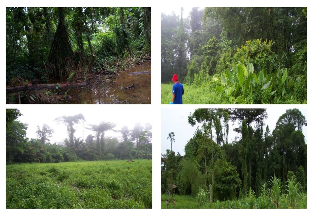
Figure 4. Terminalia Forest (Sampling site 2).

within one of the quadrates established in the site. The distance from the sampling site to anthropogenic clearing and human settlements was about 50 meters. Slash and burn and small scale farming can be observed few meters away from the sampling site.